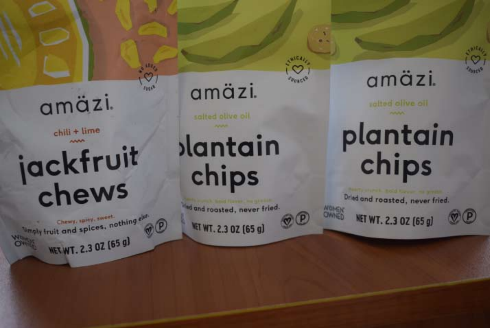
Some of the products exported by Negonja Organics

probably price one packed of plantain chips at the same price as a chicken which would not get as much demand as it would on the international market. But secondly, our equipment was imported primarily to produce for export and URA exempted the equipment on that basis. Now if we are to start manufacturing locally then we would have to pay the taxes from which we were exempted but we would also be disadvantaging a local manufacturer who paid their taxes to produce locally.