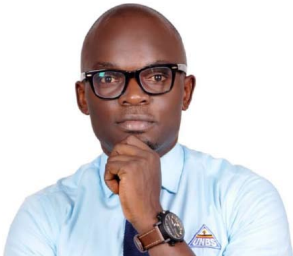
By Maurice Musuga Senior Information Officer

Countries have continued to impose a growing number of standards to protect the health and safety of their citizens and to meet demands of buyers for their specific needs. The International Trade Centre (ITC), has noted that most problems faced by exporters are a result of non-tariff measures due to technical regulations, conformity assessment procedures, and sanitary and phytosanitary measures. Enterprises intending to export their products need up-to-date information about the applicable technical requirements, both voluntary and mandatory, in their target markets. After obtaining this information, they have to adapt their products and processes to satisfy export market requirements and demonstrate compliance with them.